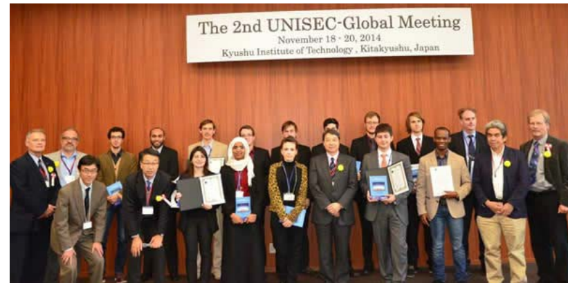
MIC3 finalists and reviewers, Nov 19, 2014, Kitakyushu, Japan