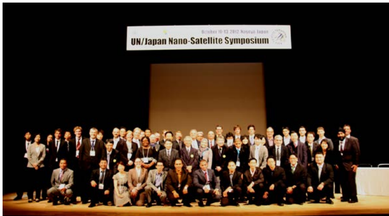
MIC2 final presentation, Oct. 10, 2012, Nagoya, Japan